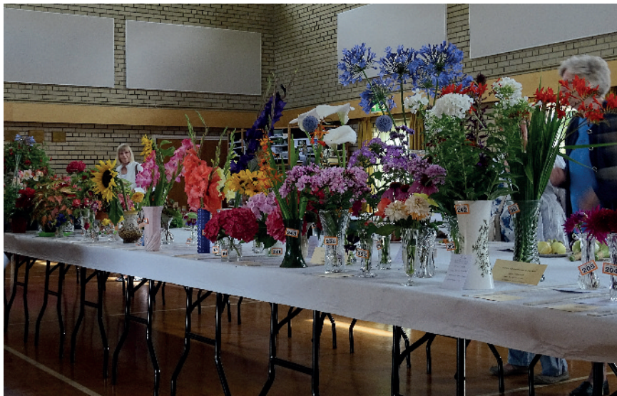
Great Stukeley Flower, Garden & Craft Show. Results on Pages 16 & 17