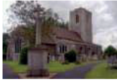
ST BARTHOLOMEW'S GREAT STUKELEY