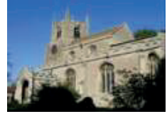
ST MARTIN'S LITTLE STUKELEY