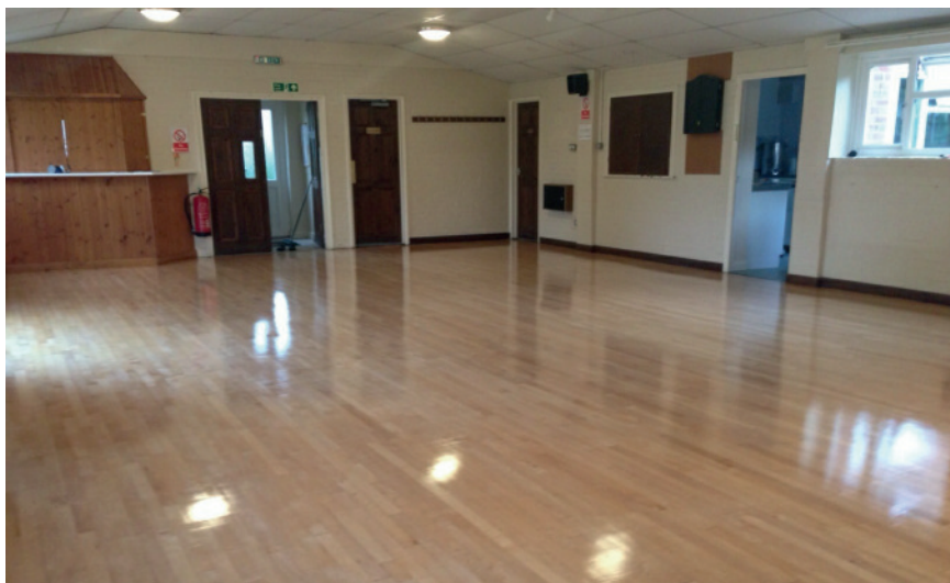
Little Stukeley Village Hall's newly re-varnished floor. See Pages 7,8 & 9.