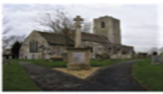
ST BARTHOLOMEW'S GREAT STUKELEY