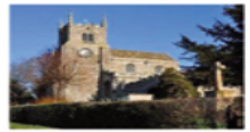
ST MARTIN'S LITTLE STUKELEY

Some of the longed-for rain has finally arrived in our villages. Maybe there'll be enough to avert any crises for us. In other parts of the world, the crisis has already come. In Pakistan, and other places, it's come as too much rain, or erratic monsoons. In many parts of Africa and Asia there hasn't been enough rain; successive harvests have failed.