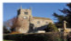
ST MARTIN'S LITTLE STUKELEY