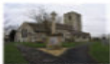
ST BARTHOLOMEW'S GREAT STUKELEY