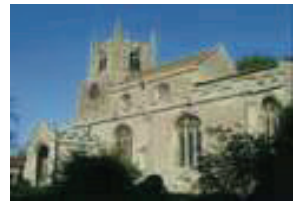
ST MARTIN'S GREAT LITTLE STUKELEY