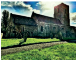
ST BARTHOLOMEW'S GREAT STUKELEY