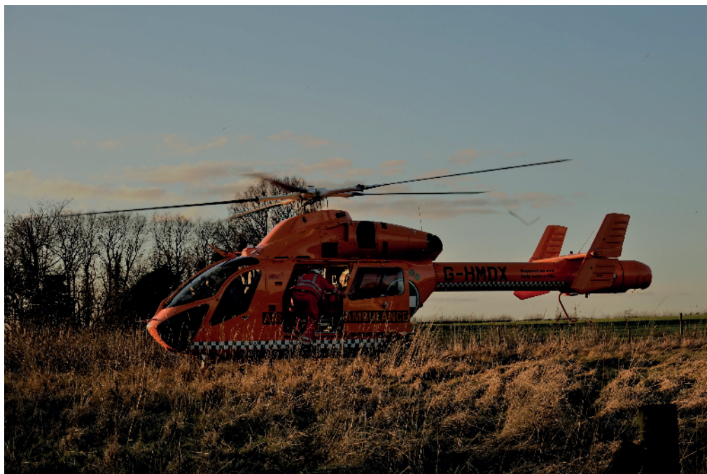
MAGPAS Air Ambulance lands in the field behind Mill Close, Little Stukeley. See Page 6