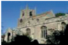
ST MARTIN'S LITTLE STUKELEY