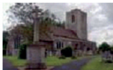
ST BARTHOLOMEW'S GREAT STUKELEY