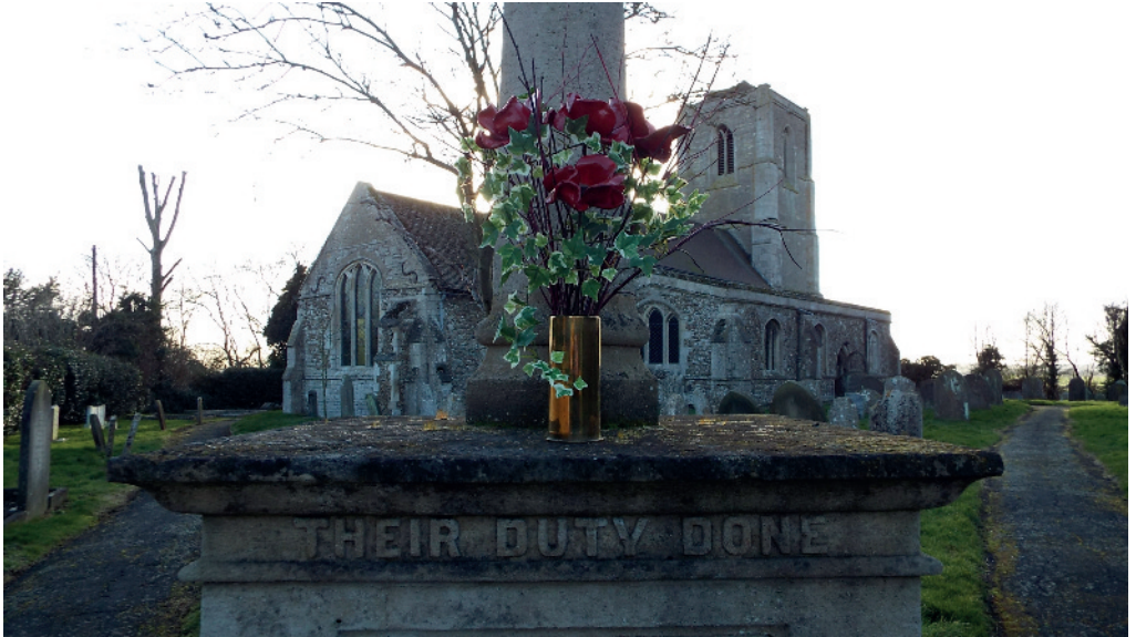
Please see page 9.