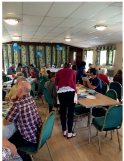
Fund Raising Tea Party on 19 September. Please see page 9.