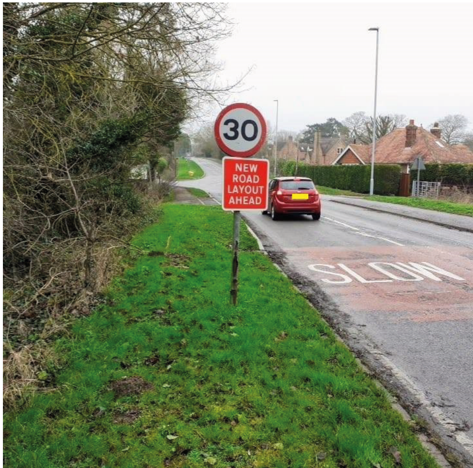
Great Stukeley new road layout. See Page 10 for Letters to the Editor