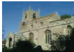
ST MARTIN'S GREAT LITTLE STUKELEY