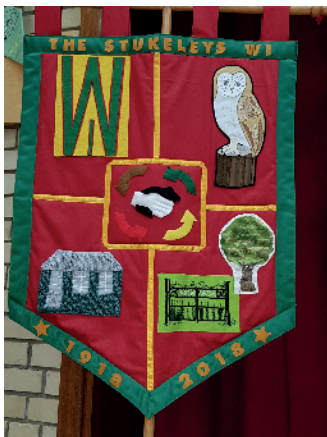
The Stukeleys WI Centenary Banner

The Stukeley's WI Centenary Celebrations 7 February 2018