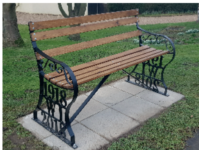
The Stukeleys WI commemorated their Centenary by purchasing a bench for Great Stukeley

THE CUT-OFF DATE FOR THE APRIL MAGAZINE IS 9AM 15/3/2018!