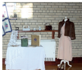
Display at GSVH depicting 1930s

The Stukeley's WI Centenary Celebrations 7 February 2018