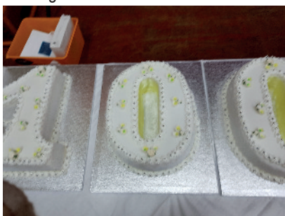
The Stukeleys WI Centenary Cake