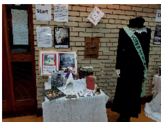
Display at GSVH depicting 1918 With Suffragettes costume