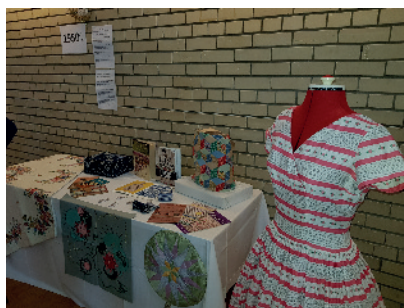
Display at GSVH depicting 1930s