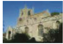
ST MARTIN'S LITTLE STUKELEY