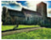
ST BARTHOLOMEW'S GREAT STUKELEY