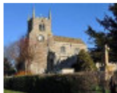
ST MARTIN'S LITTLE STUKELEY