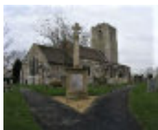
ST BARTHOLOMEW'S GREAT STUKELEY