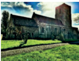
ST BARTHOLOMEW'S GREAT STUKELEY