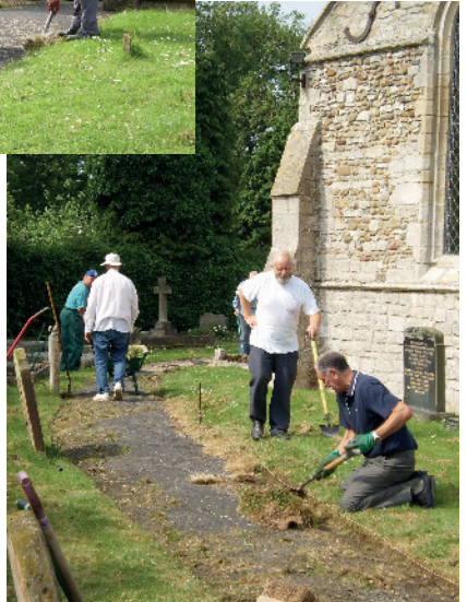
Volunteers helping to get the churchyard ready for Open Gardens