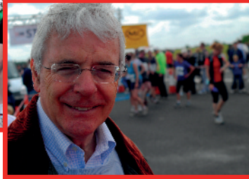
Former local MP and Prime Minister Sir John Major enjoying the day

Cook Italian Huntingdon 10k Charity Run hailed a success See centre pages