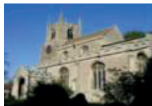
ST MARTIN'S LITTLE STUKELEY