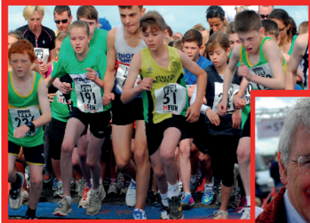
3K Fun Run Start Line