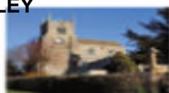
ST MARTIN'S LITTLE STUKELEY