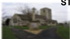
ST BARTHOLOMEW'S GREAT STUKELEY