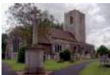
ST BARTHOLOMEW'S GREAT STUKELEY