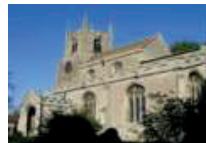
ST MARTIN'S LITTLE STUKELEY