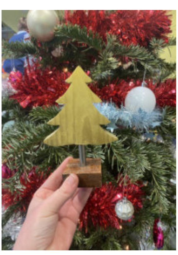
Alconbury Community Preschool See Page 8