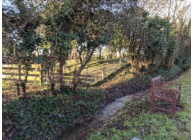
The barrow at Ermine Street/Hill Close

On the other side of Ermine Street where Hill Close ends, the other Roman barrow also remains a substantial earthwork and is also exceptionally well preserved.