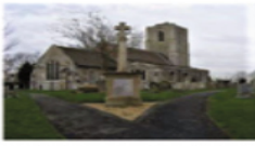
ST BARTHOLOMEW'S GREAT STUKELEY