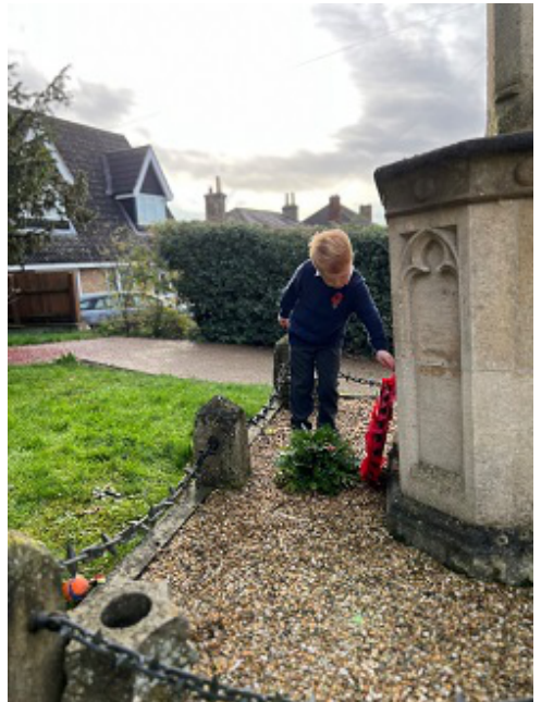
Laying the Wreath in Little Stukeley