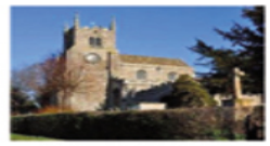
ST MARTIN'S LITTLE STUKELEY