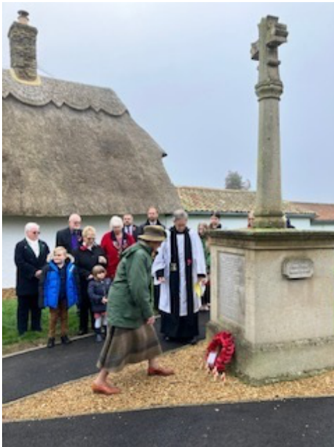
Laying the Wreath in Great Stukeley