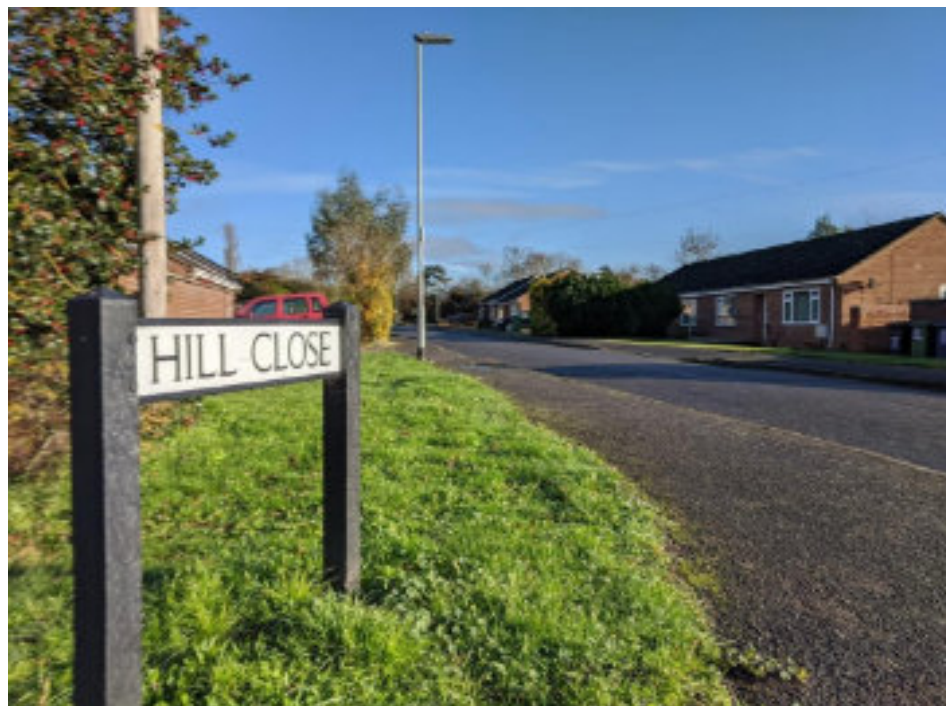
Hill Close today

But on the other side of what is now Church Road, on another piece of land, they erected 7 ex-War Department green wooden huts, converted into 14 semi-detached homes. This was known as Hill Close and they survived until the present local council bungalows were built in c.1975.