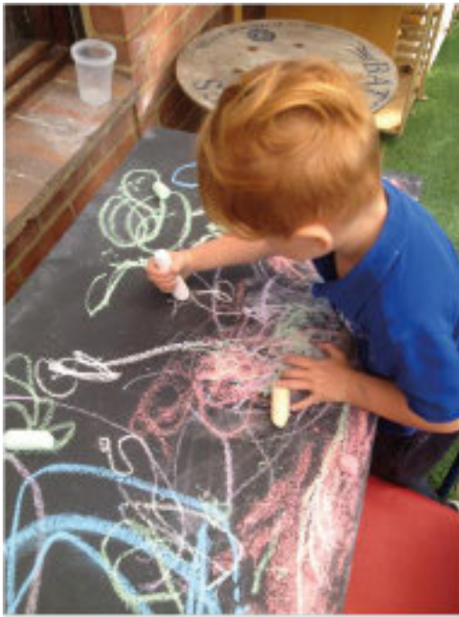
Mark making 3