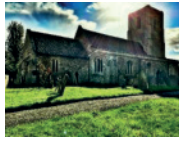
ST BARTHOLOMEW'S GREAT STUKELEY