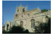
ST MARTIN'S LITTLE STUKELEY