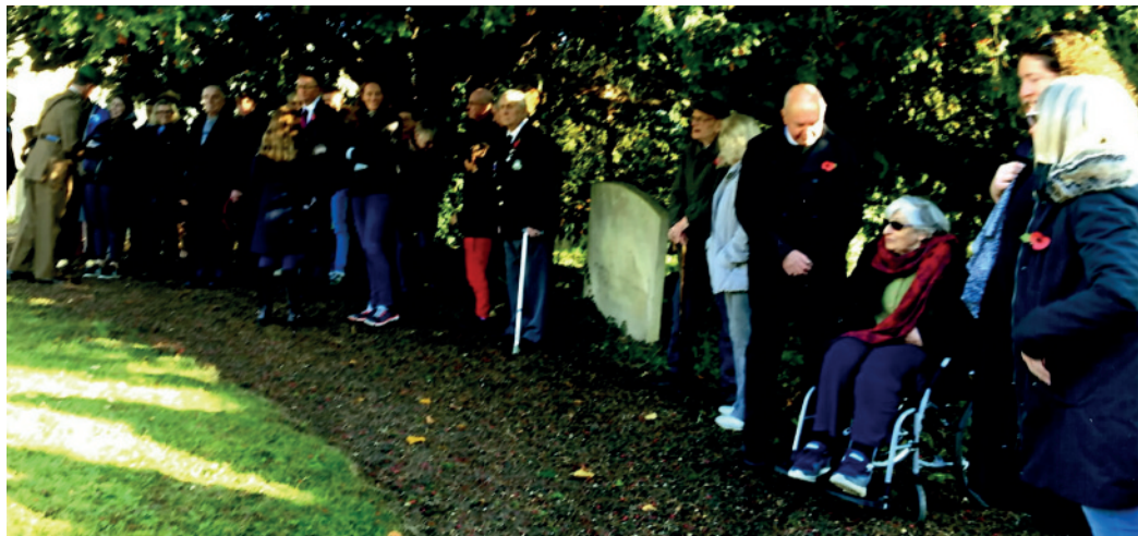
Families at Little Stukeley Memorial Service.

Please note that the cut-off date for the January 2020 Magazine is 9am Saturday 14 th December 2019