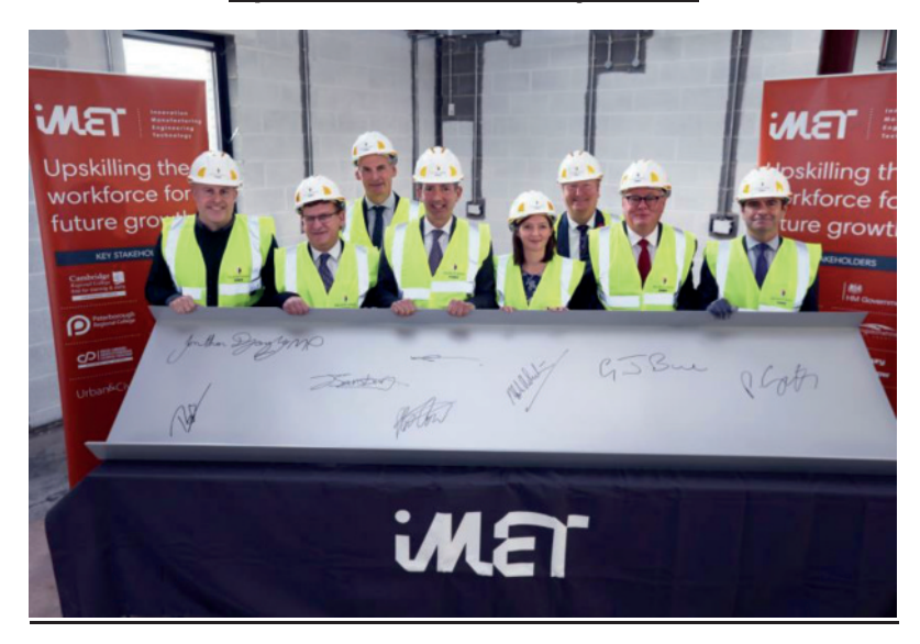
iMET Topping Out 3rd November 2017

It's been a busy time up at Alconbury Weald as the delivery progresses across both the new It's been a busy time up at Alconbury Weald as the delivery progresses across both the new