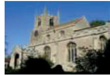
ST MARTIN'S LITTLE STUKELEY