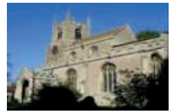
ST MARTIN'S LITTLE STUKELEY