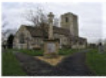
ST BARTHOLOMEW'S GREAT STUKELEY