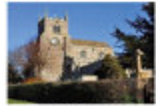
ST MARTIN'S LITTLE STUKELEY