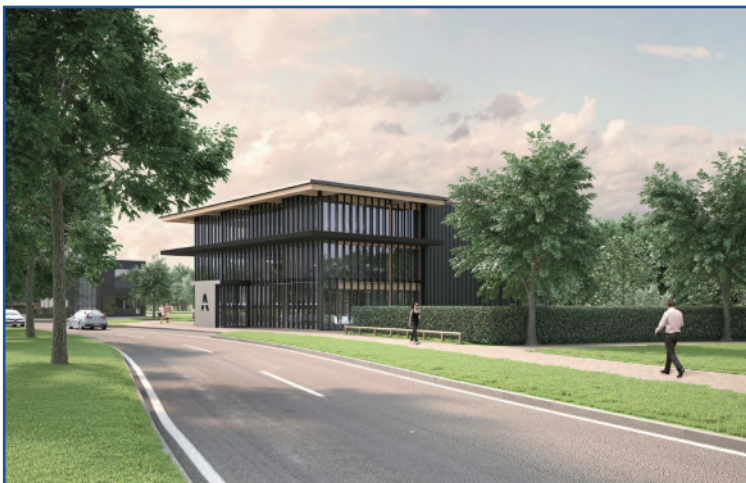
Alconbury Weald External Approach For update on what is happening please see Pages 6 & 7