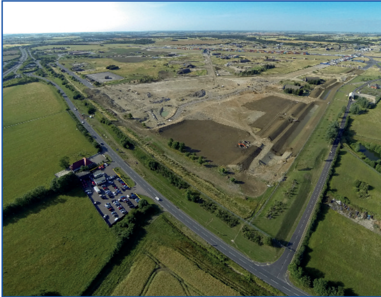
Alconbury Weald Key Phase 1A 9th July