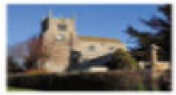
ST MARTIN'S LITTLE STUKELEY