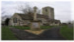
ST BARTHOLOMEW'S GREAT STUKELEY